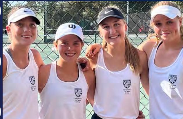
VICTORIOUS U19A AFTER THEIR VICTORY OVER BLOEMHOF